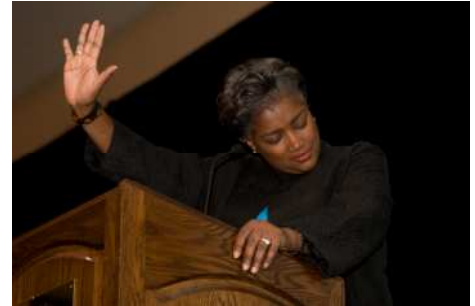
Brazile Wows the Crowd