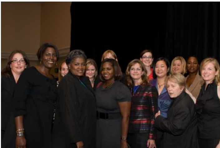
WWL 2007-2008 State Board with Keynote Speaker Donna Brazile