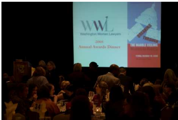
WWL 2008 Annual Awards Dinner