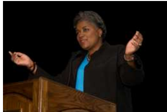
WWL Keynote Speaker, Donna Brazile